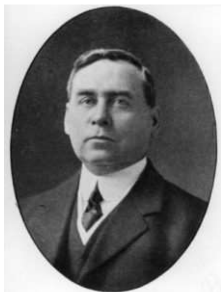
Figure 1. John Charles Fields before 1912.

Also in 1913, University of Toronto (U of T) Mathematics Professor “John Charles Fields [1863–1932] was asked by U of T President Robert Falconer [1867–1943] to extend an invitation to the American Association for the Advancement of Science to hold its 1915 meeting in Toronto” [11, p. 77]. World War I interrupted the planning, but after the war the AAAS was invited once more. Its leadership accepted for the 1921 Winter Meeting. The University and the Royal Canadian Institute, of which Fields was President, were designated the official co-hosts. Even the general public anticipated the event, as the day before the meeting began (Monday, December 26, 1921), the front page of Toronto’s The Globe trumpeted: “EMINENT MEN TO VISIT CITY” for a “FOUR-DAY CONVENTION,” a “Great Gathering in Toronto of Scientists of This Continent,” noting that the previous “Toronto Meeting took place the summer before the King’s College fire in 1890” [1].