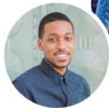
Pinpointing How Genes Interact