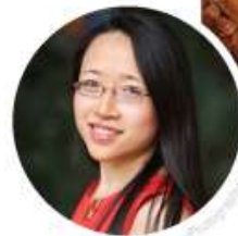
Mixing Math and Cooking