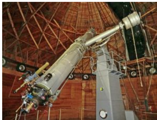
Figure 2. Vesto Slipher (1875–1969) and the Clark 24" Refractor at the Lowell Observatory in Flagstaff, Arizona.

As the 1920s unfolded there were exciting developments in both observational astronomy and relativistic cosmology [11, 12, 13, 20]. Astronomers recognized that the spiral nebulae are very distant objects external to the Milky Way galaxy. Further spectroscopic work by Edwin Hubble and Milton Humason at Mount Wilson established that there is a linear relationship between distance and redshift, a result presented in 1929 in a famous paper [8]. Meanwhile researchers in relativistic cosmology devised various geometric models, "invented universes" in the words of one historian [10]. In 1922 the Russian mathematical physicist Alexander Friedmann published a geometric model of an expanding universe. Although Friedmann did not refer to contemporary astronomical work, it is important to note that he cited writings by the Dutch mathematical astronomer Willem de Sitter and English astrophysicist Arthur Eddington in which Slipher's observations were discussed. Later in the decade Georges Lemaître developed mathematical models similar to Friedmann's, but he presented them as actual physical descriptions of the universe.