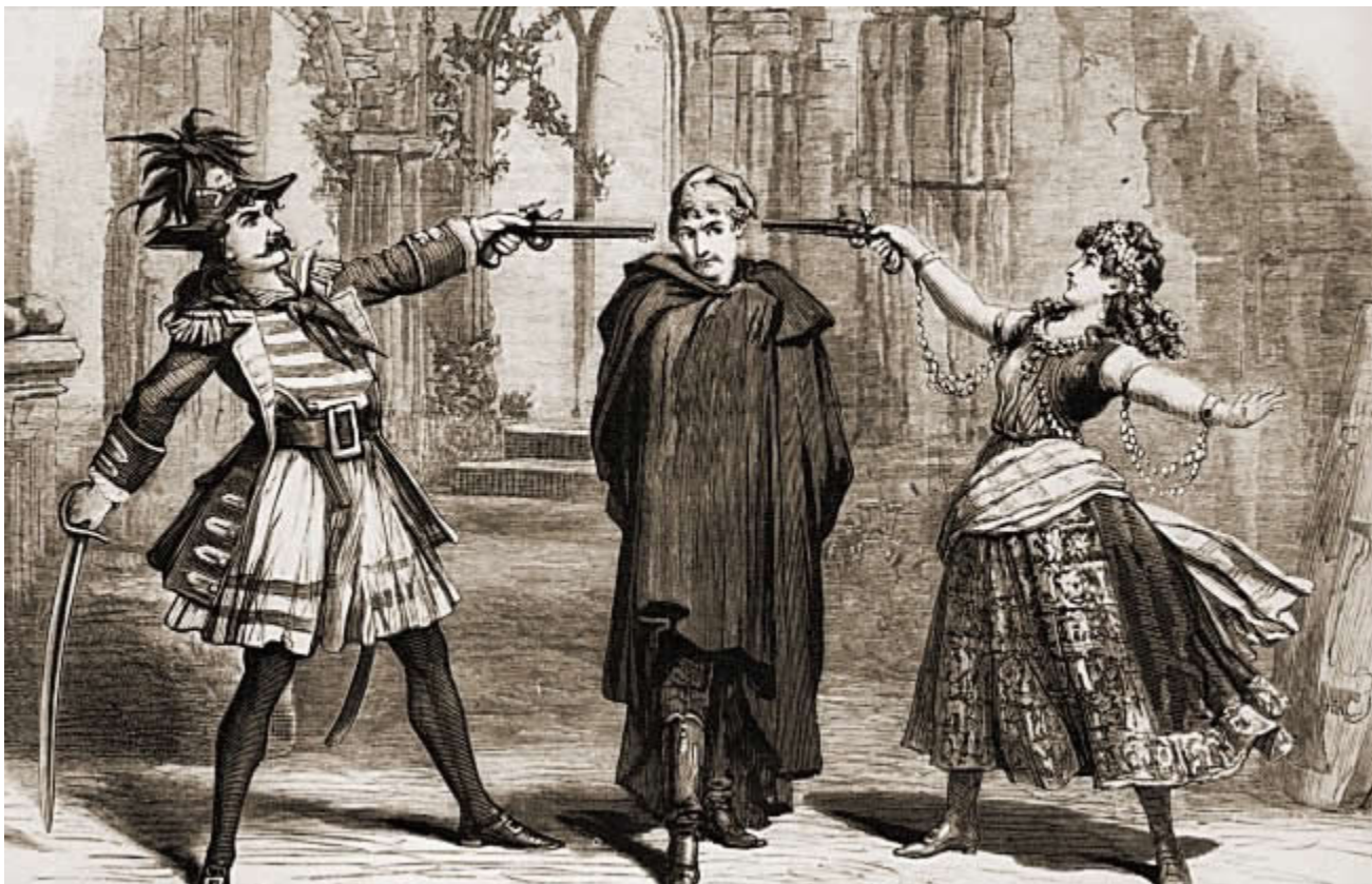
Figure 3. An 1880 drawing of the 'paradox trio' from Act II of The Pirates of Penzance, in which the Pirate King and Ruth hold Frederic at gunpoint while they explain the paradox engendered by his February 29 birthday. Commissioned by D'Oyly Carte Opera Company for the opera's London premiere.

Quantum mechanics has also been a source of paradoxes, and one can argue that it is a source of nothing but paradoxes. The continuing literature on how to interpret the formalism that produces correct predictions suggests that there is no consensus about interpretation, however ready the community of physicists may be to accept the formalism. Hidden variables have been shown not to work, and if it is necessary to alter one's logic, that has a paradoxical character in its own right.