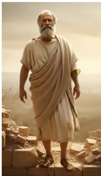
Figure 1. Screenshot of a presumably AI-generated Socrates stating a mistranslation from Apology , 21d. YouTube video by thevoiceofsocrates , 28 November 2025.

There is nothing particularly mathematical about the word 'paradox'. Just as 'orthodox' refers to 'right belief' and 'heterodox' refers to 'different belief', so 'paradox' refers to 'beyond belief' ('para' as a prefix has a range of applications). The word is of venerable antiquity, and examples abound even in Greek times. Anthony Gottlieb, for example, refers to the 'paradoxical' style of Heraclitus, as exemplified in sayings such as 'The upward road and the downward road are the same road' [4, p. 41]. Even better known is the story of Socrates, who was puzzled by the verdict of the oracle at Delphi that he was the wisest of all Greeks. He was aware of how little he knew, but in conversing with others they always seemed to claim more knowledge than they actually possessed.